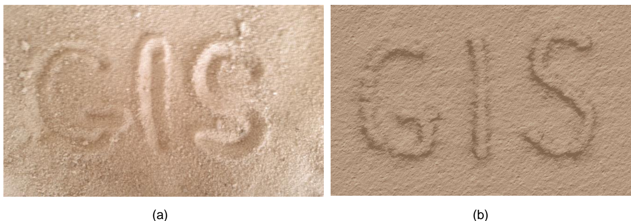
Fig. 3. The word GIS written in real sand (a); simulated using our system (b).