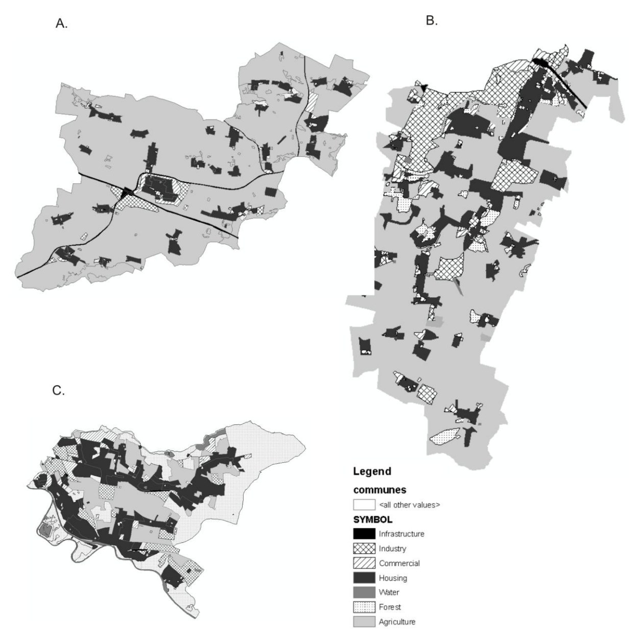
Fig. 4. Development of Kostomloty (A), Kobierzyce (B) and Czernica (C)