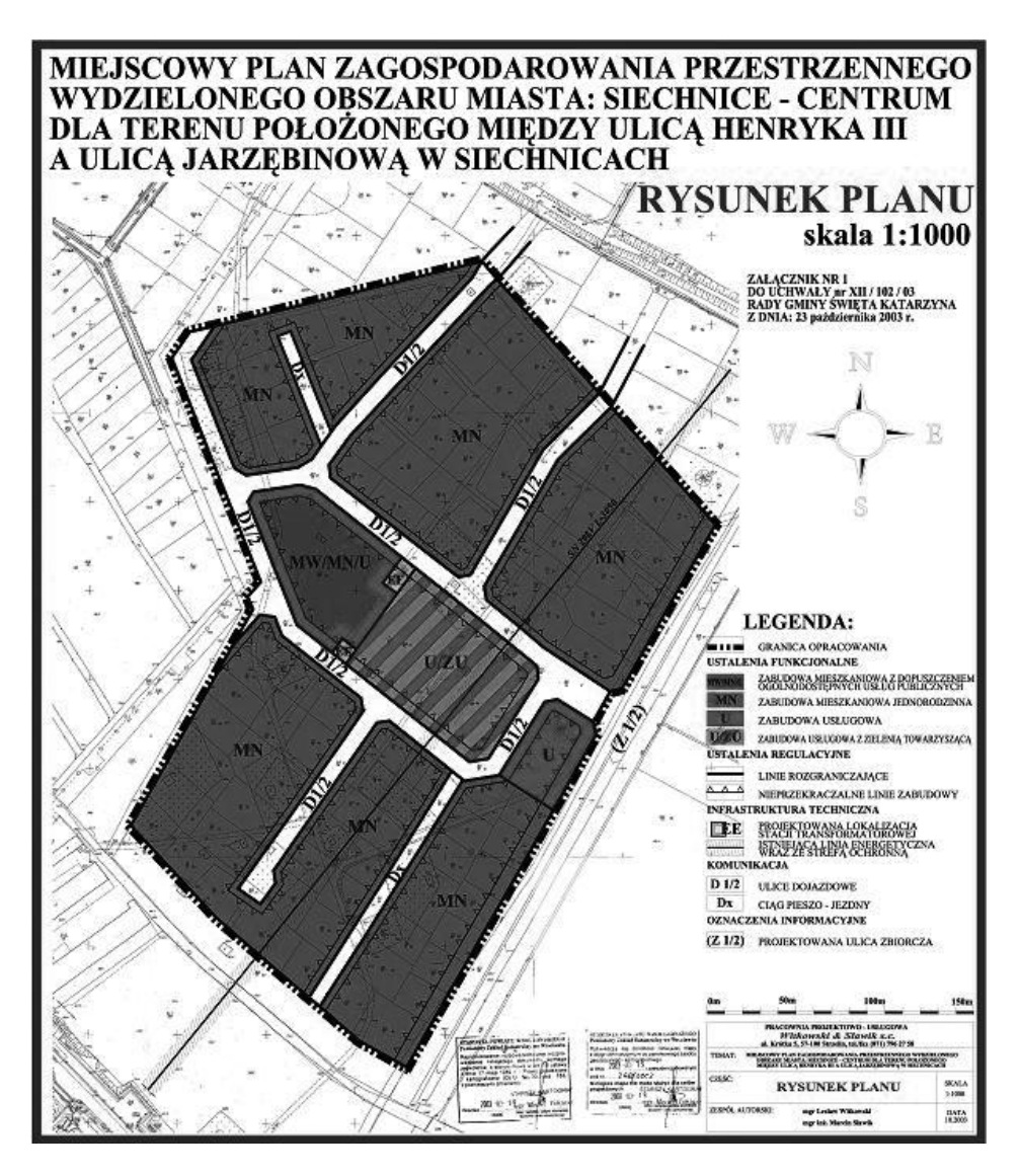
Fig. 1. Local spatial plan for part of the area: Siechnice - Center (source: www.siechnice.gmina.pl)

To calculate values in CommunityViz, system was provided with geoinformation describing the topological characteristics of the terrain and objectives defined by the operator of the program. Because the system used in the study is a framework to ArcGIS, it was benefited in the electronic format tailored to the vector spatial data. Assumptions values were set freely and they are modifiable in the CommunityViz interface. Data assumptions should come from external databases (available in parametric form) or they should come from operator's expertise (Fig. 2).