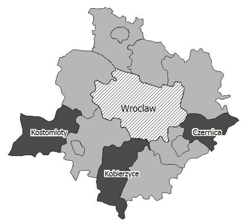
Fig. 3. The map of Wroclaw Larger Urban Zone

from GUS data. Calculations were taken on Kobierzyce which had highest rate of water use, Czernica with average level and Kostomloty where use of water was the lowest. The bottom map shows area of Wroclaw and surrounding communes (fig. 3). To the west of Wroclaw is located Kostomloty, to the south Kobierzyce and to the right of it is Czernica. Central city is strapped and selected communes are marked darker grey colour.