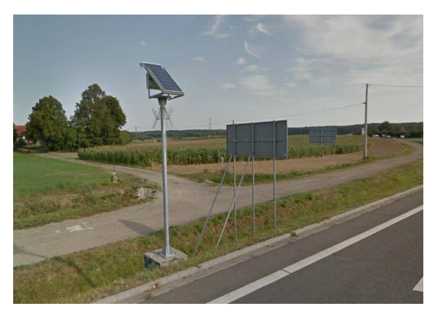
Fig. 2 Object identification in space on the national road No. 16: point 38 Gietrzwałd (126+250 km)

The precise location of the object was possible by using the Google Maps and Street View service.