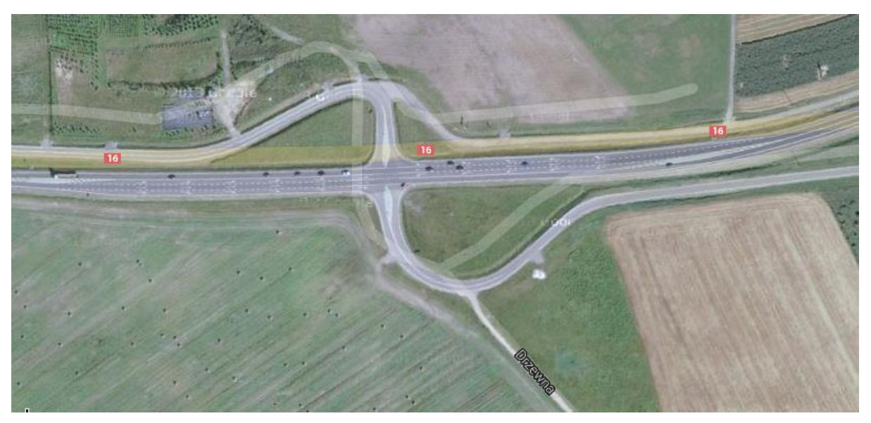
Fig. 1 Rough location of points on the national road No. 16 (Gietrzwałd)

The precise location of the object was possible by using the Google Maps and Street View service.